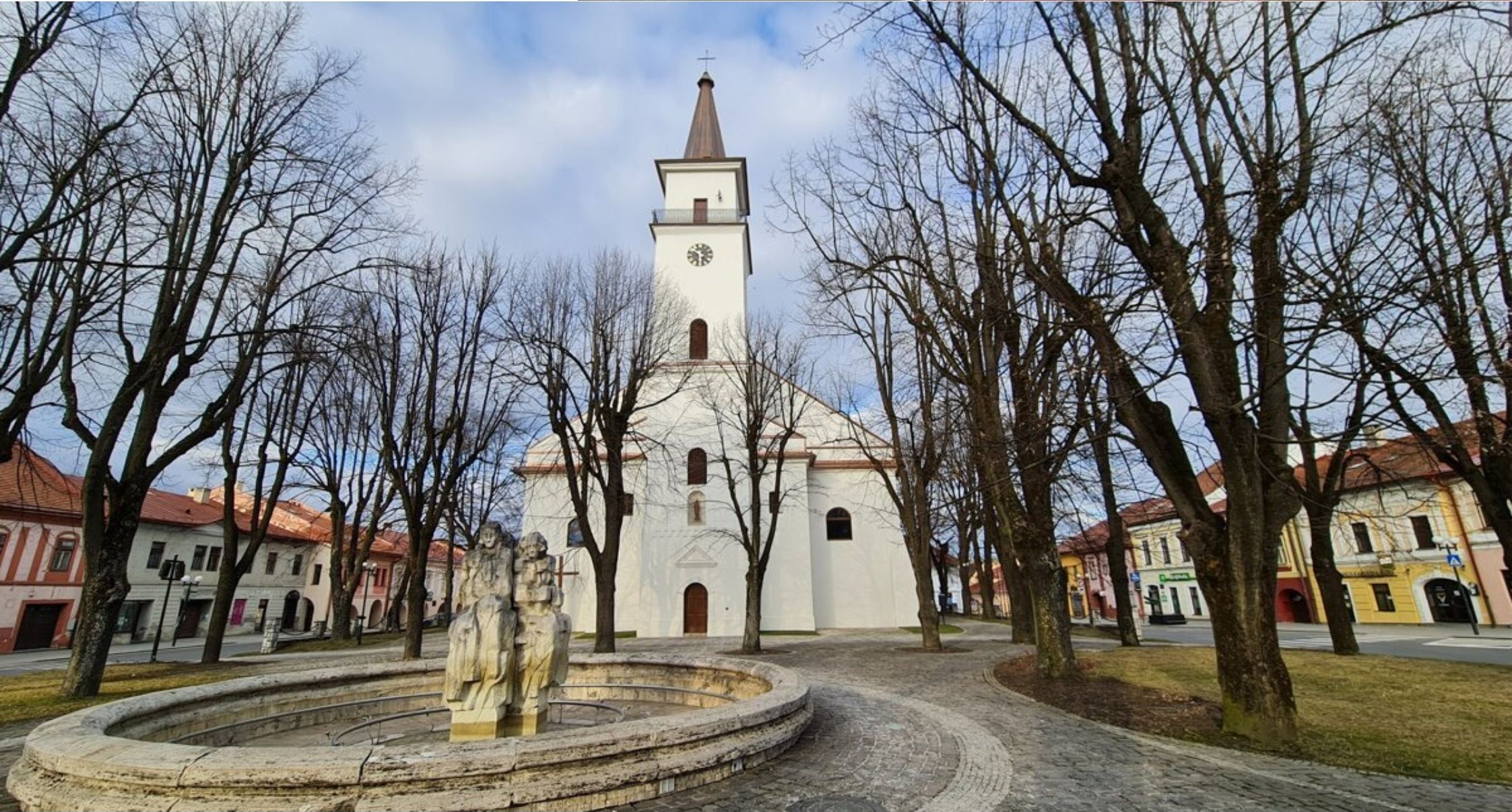
St. Nicolas Roman Catholic church