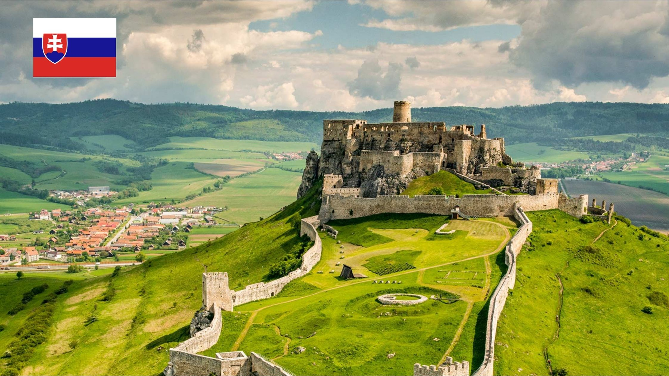
Spiš Castle UNESCO World Heritage